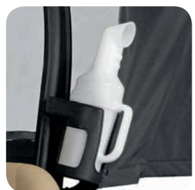
Divot Repair Sand Bottle