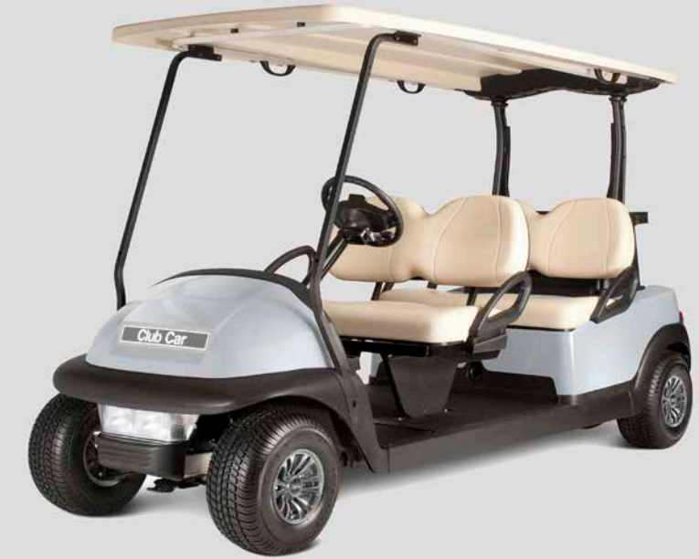
Rust-proof aluminum frame