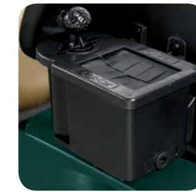
Ball and Club Cleaner