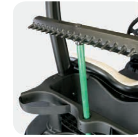
Sand Trap Rake Kit