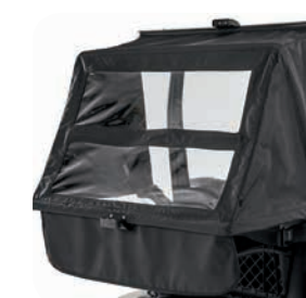
Bag Cover with Magnetic Latch