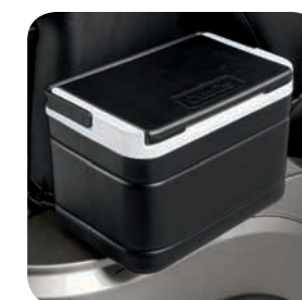
Caddy Master Cooler