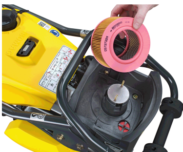
Maximum reliability and longevity All around engine protection