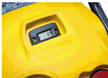
More transparency Hour counter/tachometer with a service indicator which can be reset