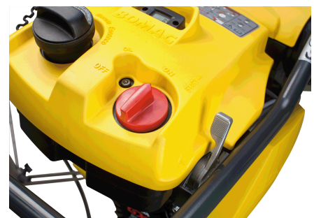
Simple operation Engine and fuel supply with combined switch