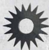
STEEL CUTTERS POINTED 18 Pt Part# 12206