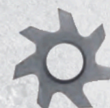
CARBIDE MILLING CHUCKER 7 Pt Part# 20336