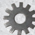
STEEL CUTTERS FLAT 12 Pt Part# 20206