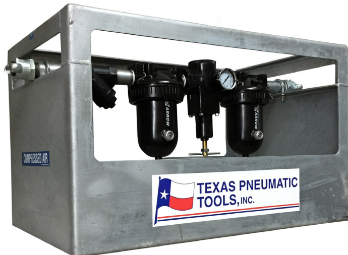
Portable FRL Systems from 1/2" to 1-1/2" NPT