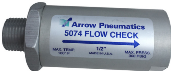
Air Flow Check Valves