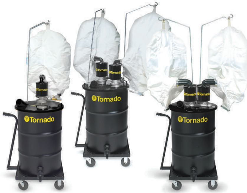
SINGLE AIR JUMBO